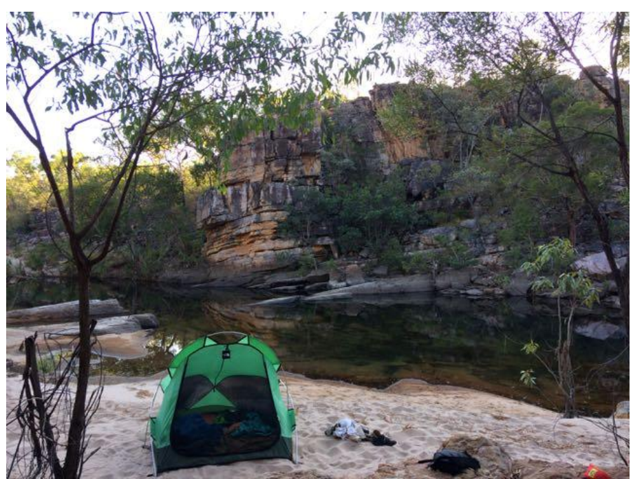
Camping on Twin Falls Creek close to the gorge.