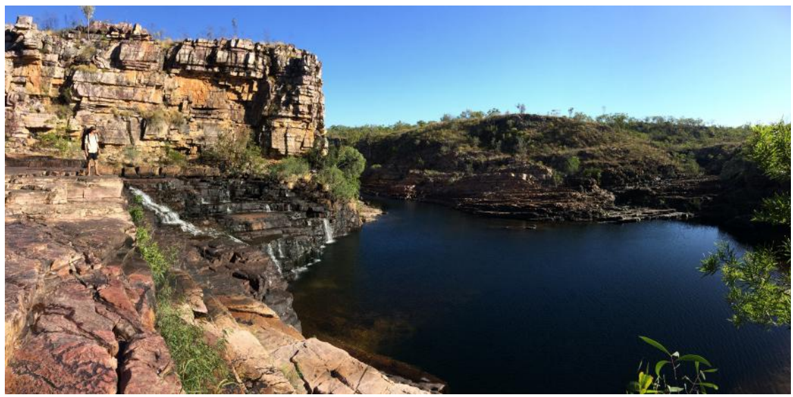
The Ampitheatre, Twin Falls Creek

This walk is both an exploration of magnificent country filled with rocky gorges and waterfalls as well as an exploration of our inner worlds and developing tools to assist us to achieve greater clarity in our communication with ourselves and others. It is a precious opportunity to immerse in wilderness connecting with ourselves, each other and our world.