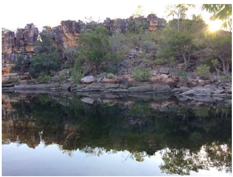
So many beautiful pools to choose from