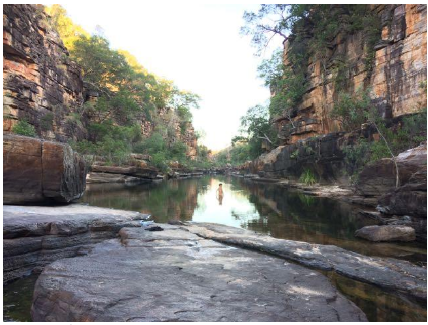
Swimming in the gorge