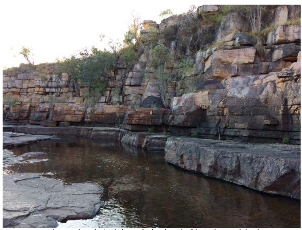
Camping above the Amphitheatre. On the other side of the creek are sandy beach options