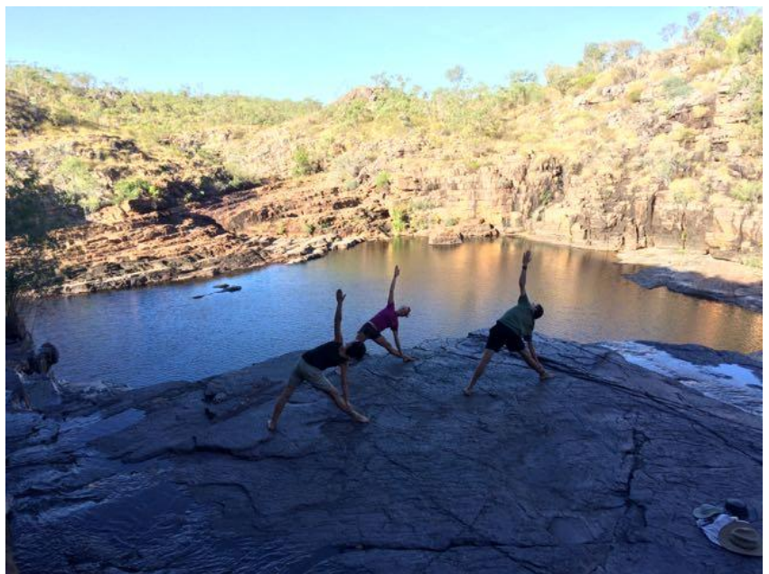
Beautiful rock ledges for stretching at the Amphitheatre., with waterfalls behind and below us.

Each day after this will start with optional sunrise meditation and yoga based exercises.