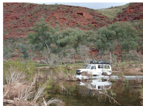
Driving the Boggy Hole Track in a wet year. Some years there is no water across the track anywhere .

We have a number of choices in the Palm Valley area. Some are day walks which take us through a variety of interesting rock formations. One is a longer loop lasting two or three days. This takes us through the palms and pools of Palm Valley and out into much more open country. From here, we cross to a deep gorge system and work our way back to where we began. Despite the lack of trails, the walking is relatively easy. We will have plenty of time to stop and explore some of the side gorges, climb the hills for the spectacular views and even to enjoy a swim if the weather is warm enough. Unlike most of the relatively permanent pools in central Australia, the shallow spring fed pools along Palm Creek heat up in the sun and are quite pleasant for swimming.