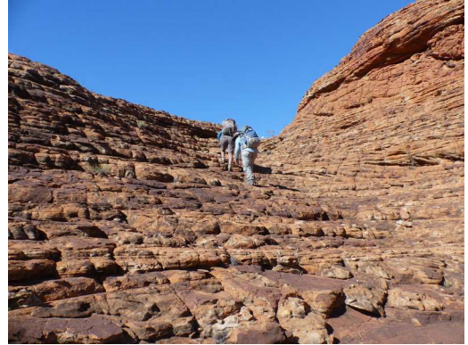
Steep climb near the start of the Giles track

The Giles Track is a little known gem. Most people take two days. A few walk it in one. We plan to spend four so that we can take our time and appreciate all it has to offer. If time permits, we will include the more famous Rim Walk at Kings Canyon as well.