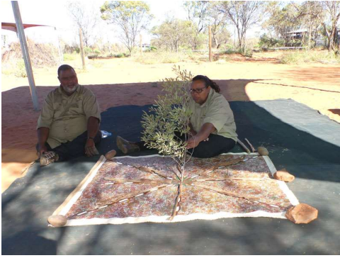
Explaining a painting on the Karrke tour