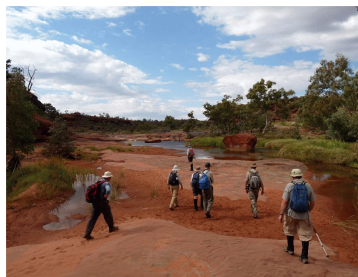
Easy walking upstream of Palm Valley

Day 14 Finish walk. Return to Alice Springs via Mereenie Loop road. Drop off at your accommodation late afternoon.