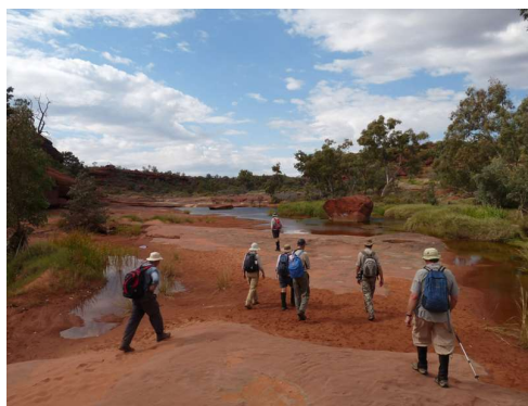
Walking above Palm Valley