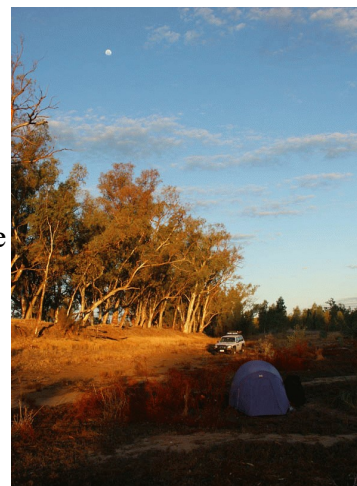
Sunset camp, Boggy Hole Track

Summary. While Palm Valley and the Boggy Hole 4WD track are the best known parts of Finke Gorge National Park, they are far from all the park has to offer. Willis's Walkabouts is the only tour operator who will take you off the tracks to places that you can only reach on foot in this park. Similarly, Watarrka is far more than Kings Canyon. You'll see the best that can be reached on a relatively short walk.