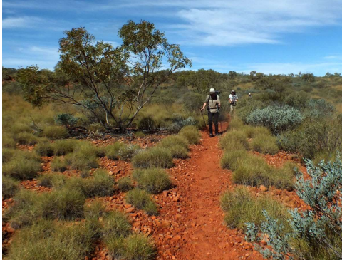
Once on top, the track is fairly flat

After the tour, we drive another 40 km to the Kings Canyon Resort where we spend the night in budget accommodation.