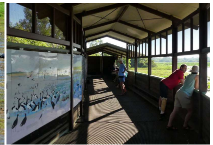
Mamukala bird hide

Sat 20 Aug 9 AM Guluyambi Cruise on the East Alligator River.