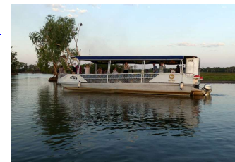
Yellow Waters boat

Breakfast. Return to Darwin. The short route goes back to Darwin via the Old Darwin Road. This is good gravel for about 100 km (about 10 km near the start is often worse than the rest). It rejoins the Arnhem Highway and you return to Darwin the way you came out. Total driving time (not counting any stops) is about 2½ hours.