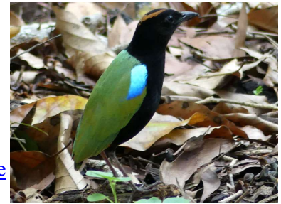
Rainbow pitta at Fogg Dam