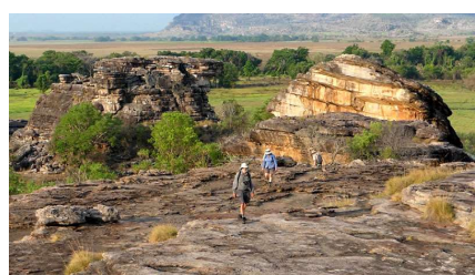
Climbing to a high view at Ubirr