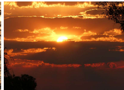
Yellow Waters sunset