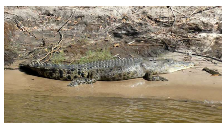
Crocodile seen on the Guluyambi cruise