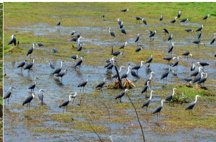
August birds at Fogg Dam