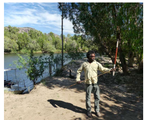
In Arnhem Land on the Guluyambi tour

https://www.ayalkakadu.com.au/kakadu-buffalo-camp-history-wildlife-tour