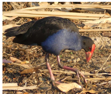
Yellow Waters Purple swamphen