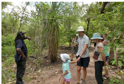
On the Pudukul tour