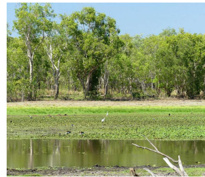
On the Anbangbang walk

to see sunset over Nourlangie (Burrungkuy). Return to Anbinik.