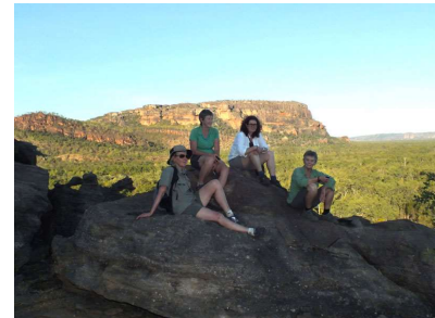
Burrungkuy view from Nawurlandja

As of Tuesday 21 June, a double was $529, a family room was $579, double in an Outback Retreat with shared bath was $529.