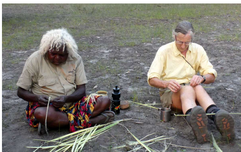
On the Animal Tracks tour