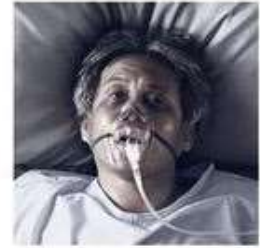
"I can't breathe."