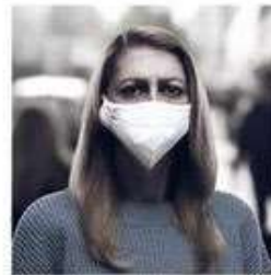
"I don't want my face covered."