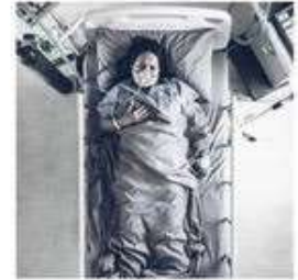
"I don't want to be alone."