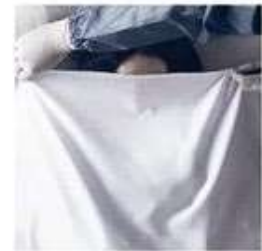
"I don't want my face covered."

I've moved on from Be Kind, Be Calm and Be Safe to Grow Up, Shut Up and Mask Up.