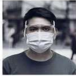
"I can't breathe."

While most people develop normally, some get stuck in the "YOU CAN'T MAKE ME!" stage.