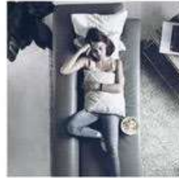
"I don't want to be alone."